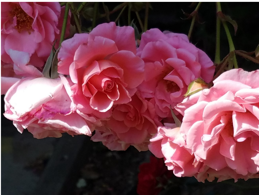
Roses blooming in the UUCY Garden

The Kittitas Valley UU Congregation in Ellensburg holds a retreat every fall at the Lazy F Retreat Center . This year it will begin on Saturday evening, September 28 and run until mid-day Sunday. The best news of all is they are inviting people from UUCY to attend this year! Many activities are available for people of all ages, including (depending on interest) Archery and a "Craft Cabin." A highlight of the weekend is a sing-a-long around the campfire on Saturday night. The accommodations are rustic cabins, and meals are included. The full adult price for the entire retreat (overnight + 3 meals) is only $72.50, with reduced rates for teens and children, and a la carte options for those who can't stay for the whole time. Please let me know if you're interested at minister@uucyakima.org .