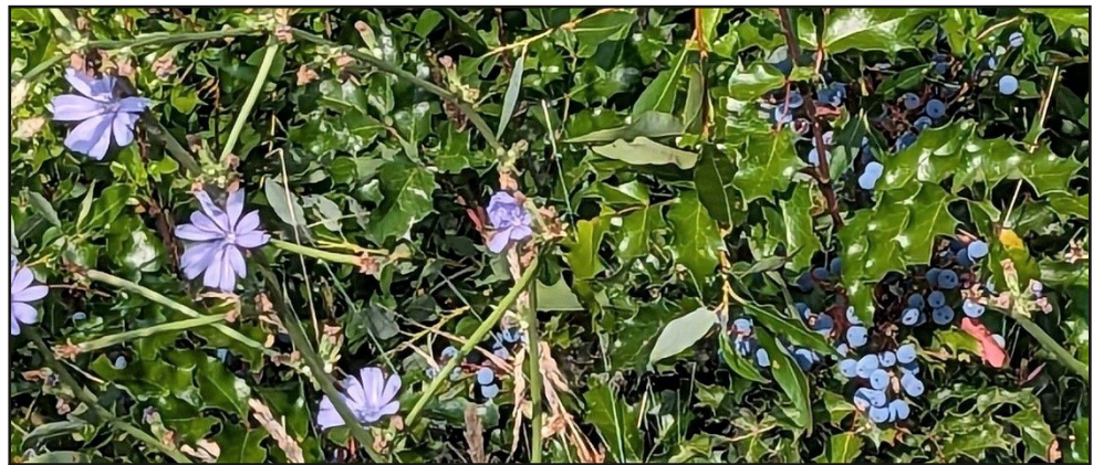
Beautiful berries and blooms along the roadside.

No outings are planned for August to avoid excessive heat and/or smoke from the wildfires that seem to be more probable the last few years. We will resume in September after Labor Day weekend. Enjoy the rest of summer and think of UUCY's contribution if you head up toward White Pass.